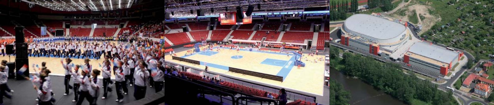
Photos of the interior and exterior of KV Arena. More about KV Arena please see www.kvarena.cz